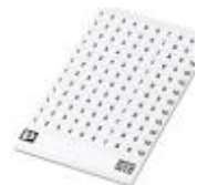
Marker card, Card, white, labeled, Horizontal: Consecutive numbers 1 - 10, 11 - 20, etc. up to 91 - (99)100, Mounting type: Adhesive, for terminal block width: 5 mm, Lettering field: 5 x 3.8 mm

Marker card - SK 5/3,8:FORTL.ZAHLEN - 0804183