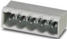
The figure shows a 5-pos. version of the product in gray

Header, Nominal current: 12 A, Rated voltage (III/2): 320 V, Number of positions: 5, Pitch: 5.08 mm, Color: pastel green, Contact surface: Tin, Mounting: Wave soldering